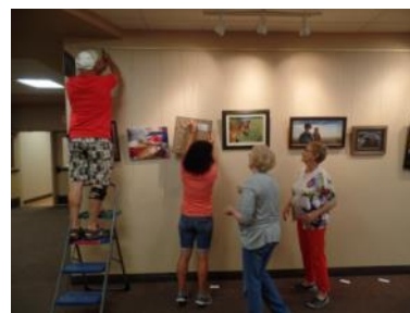
Volunteers Working Hard to Prepare!