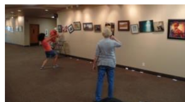
The Crooked Show! Thumbs Up!