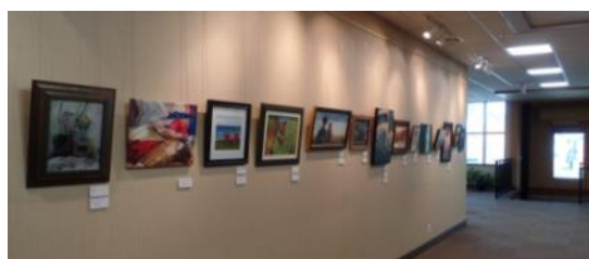
Fabulous Art Works

The ACACA would like to thank all of the hard-working volunteers that made these events possible!