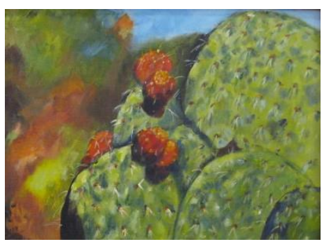
"Cactus Flowers" acrylic by Colleen Lane - Intermediate Award