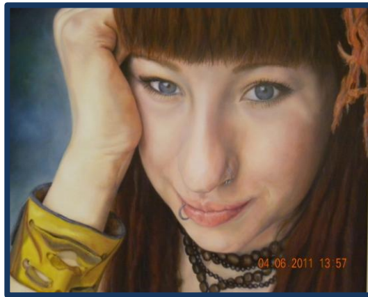
Juror's Choice Award Intermediate Award