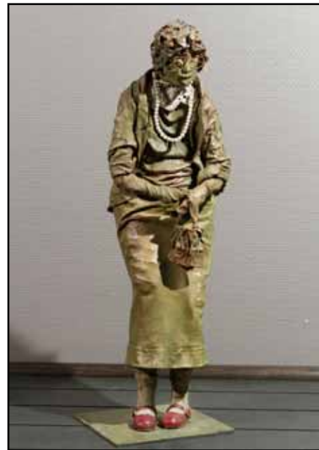
Sculpture: Rita Wildschiet, "Little Old Lady", Brooks, AB