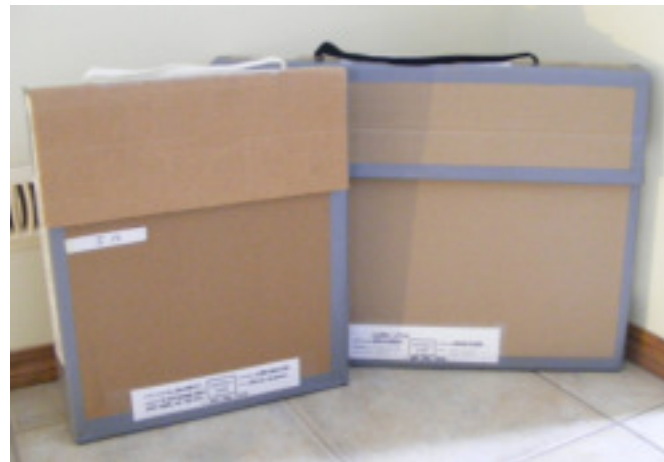
Two sizes of boxes using baffles (l to r) Small box measures 14" w x 17" h and larger box is 22" w x 16" h

If your Club would like a Box Making Workshop we'll help out with facilitators – just give us a call!