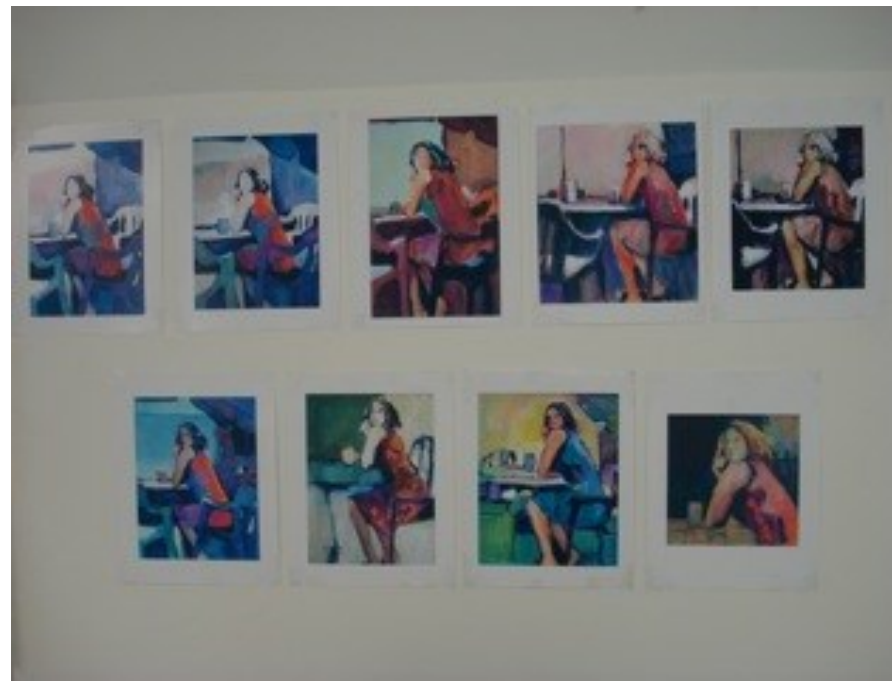
Figurative painting examples from the workshop demonstrating "The You Factor"

"Nature is not only all that is visible to the eye...it also includes the inner pictures of the soul."