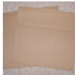
Larger Roofing Baffles measure 26" w x 24" h

BOX MAKING INSTRUCTIONS BY BARBARA CHECKRYN-RIVERS