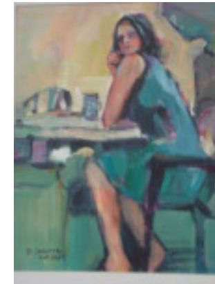
Figurative painting by Donna Zagotta