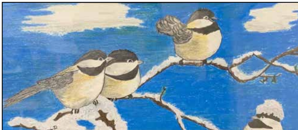
'Chickadee Cohorts' 11" x 17" framed coloured pencils