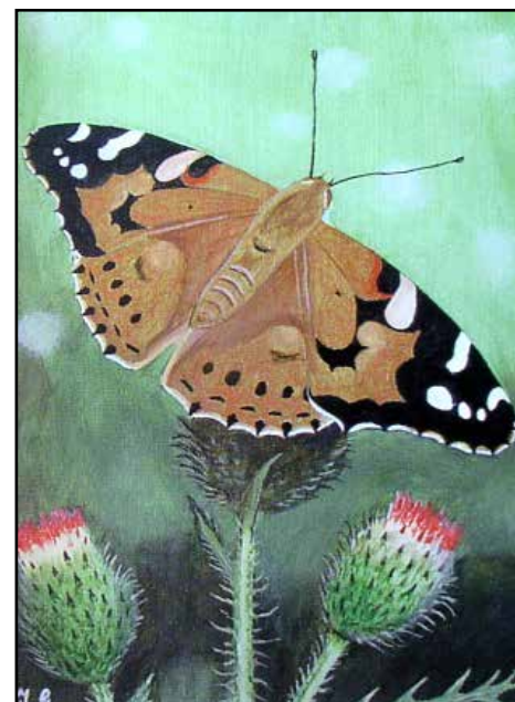
'American Painted' Lady' 12" x 9"