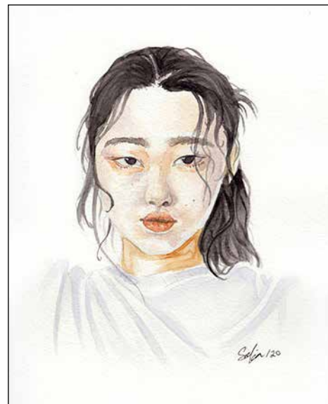
'Simple Elegance' watercolour