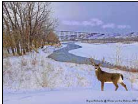
'Winter on the Oldman 2021' Work Currently in progress; possible entry in ACACA virtual show.

I am really hoping I can get some worthy pictures of my new work to enter! LOL! Painting I can handle, photography of the work, not so confident. If any of you feel like me, just call me and I will get you some help.