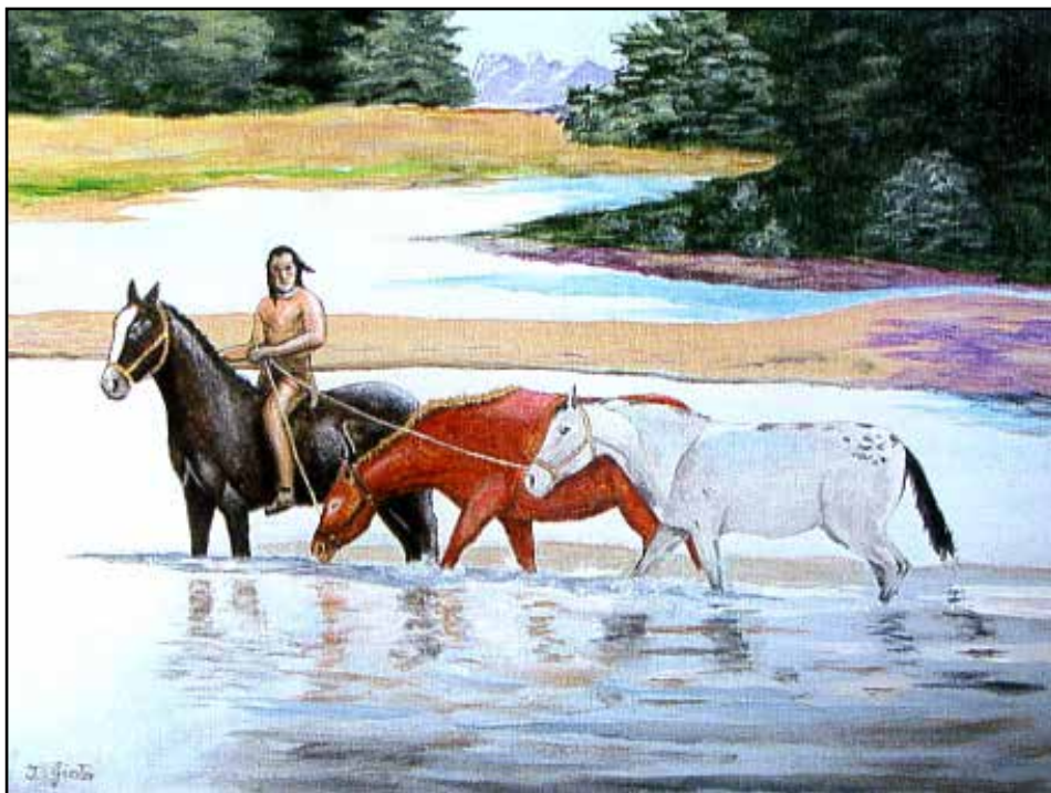
'The Horse Dealer' 20" x 16" with white border