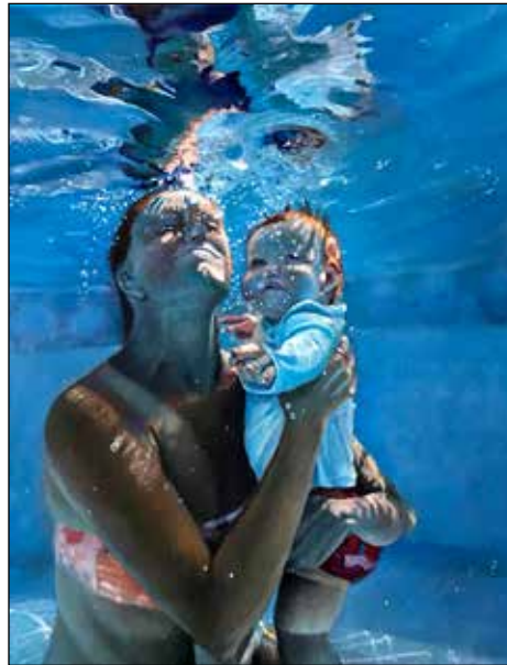
Artist: Gail Flint 'Total Immersion'