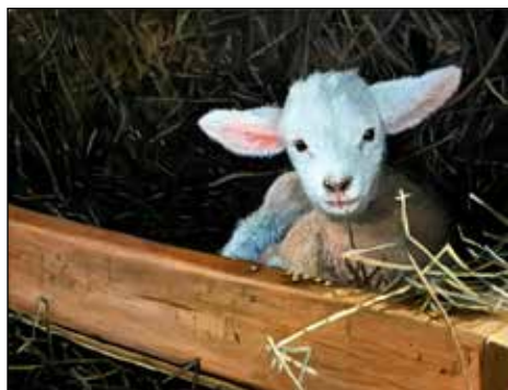
Artist: Gail Flint 'Spring is Coming'