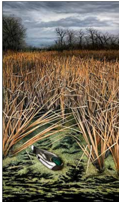
Artist: Elaine Mulder 'Rest and Dream'